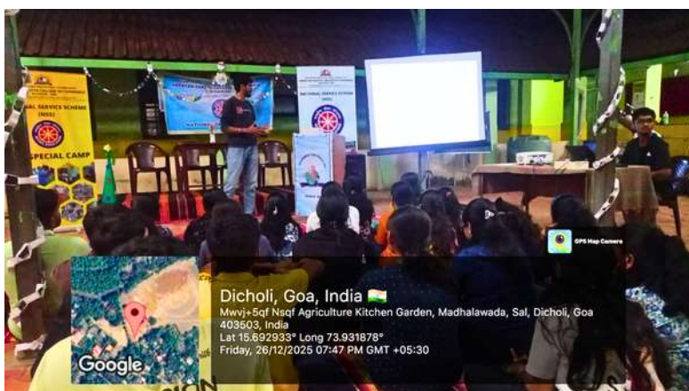
Dicholi, Goa, India Mwjv+Sqf Nsqf Agriculture Kitchen Garden, Madhalawada, Sal, Dicholi, Goa 403503, India Lat 15.692938° Long 73.931878° Friday, 26/12/2025 07:47 PM GMT +05:30