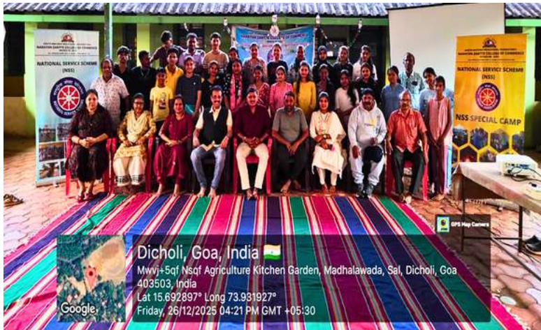
Dicholi, Goa, India Mwjv+Sqf Nsqf Agriculture Kitchen Garden, Madhalawada, Sal, Dicholi, Goa 403503, India Lat 15.692897° Long 73.931927° Friday, 26/12/2025 04:21 PM GMT +05:30