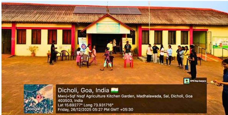
Dicholi, Goa, India Mwjv+Sqf Nsqf Agriculture Kitchen Garden, Madhalawada, Sal, Dicholi, Goa 403503, India Lat 15.69277° Long 73.931716° Friday, 26/12/2025 05:27 PM GMT +05:30