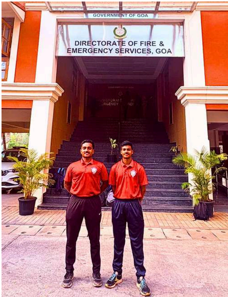
7. Participation of NCC cadets in Aapadamitra / Sakhi Training Programme

Aapadamitra / Sakhi Scheme, organized by the Fire and Emergency Services Department, Panaji, Goa, from 13 th December 2025 to 22 nd December 2025, under the guidance of Lt. Vaibhav Dhuri, ANO. The training aimed to develop disaster preparedness and emergency response skills among youth and included sessions on fire safety, first aid, rescue operations, and disaster management. The cadets actively participated and successfully completed the programme, enhancing their ability to serve the community during emergencies.